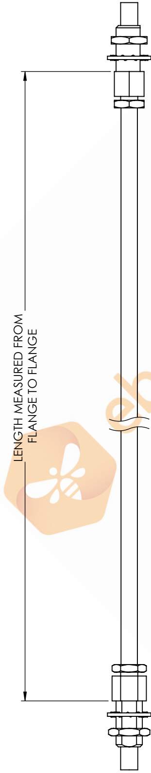
2X SSMC JACK BULKHEAD MOUNT CONNECTOR

SSMC Jack Bulkhead to SSMC Jack Bulkhead Cable 72 Inch Length Using Coax